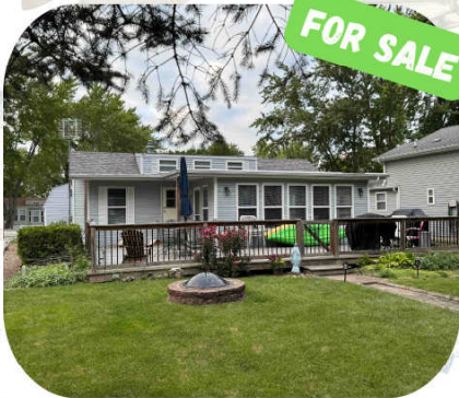
205 Fossil Cove Ln $167,000