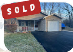
261 Fossil Bay Ct $190,000