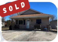
193 Sunfish Cir $179,000