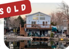
142 Tully Rd $260,000