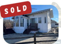
3 Lakeshore Dr $180,000