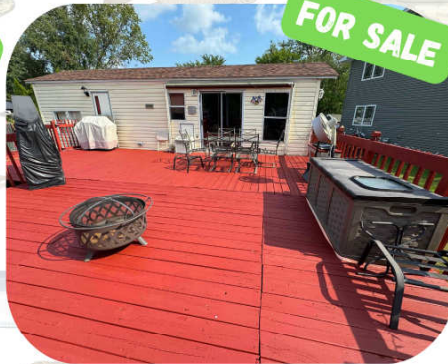
188 Fossil Cove Ln $140,000